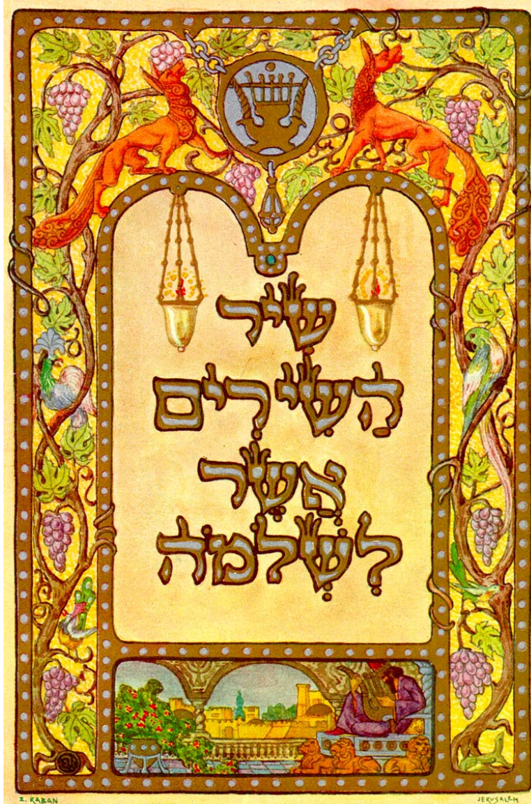
The Song of Songs which is Solomon's